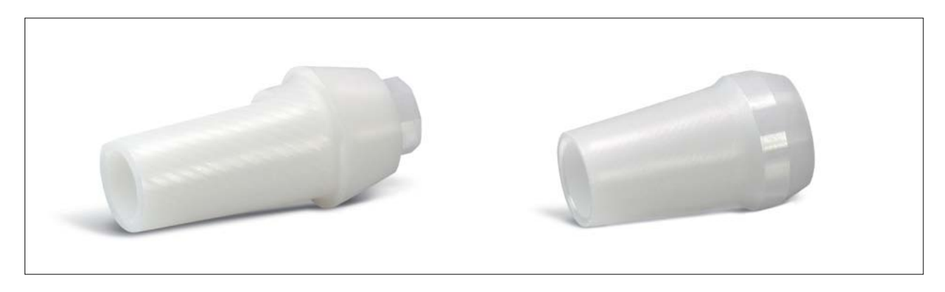
Fia. 1 Complex shaped dental implant abutments

With over 100 years of experience, Ceramaret has built a solid reputation for the reliability and quality of both its ceramic parts manufacturing and the service it provides. Our customers can rely on a solid engineering team to support and quide their designers at the very earliest stages of new ceramic projects. The time to market can be significantly reduced if the first prototypes are functional and do not require multiple iterations before the final design is reached.