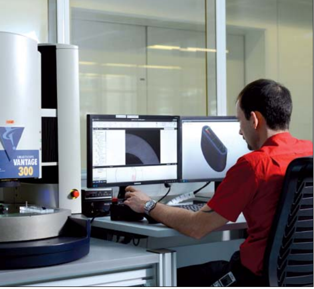
State-of-the-art metrology equipment, a high accuracy multisensor measurement system

It is no secret that precision and aesthet-