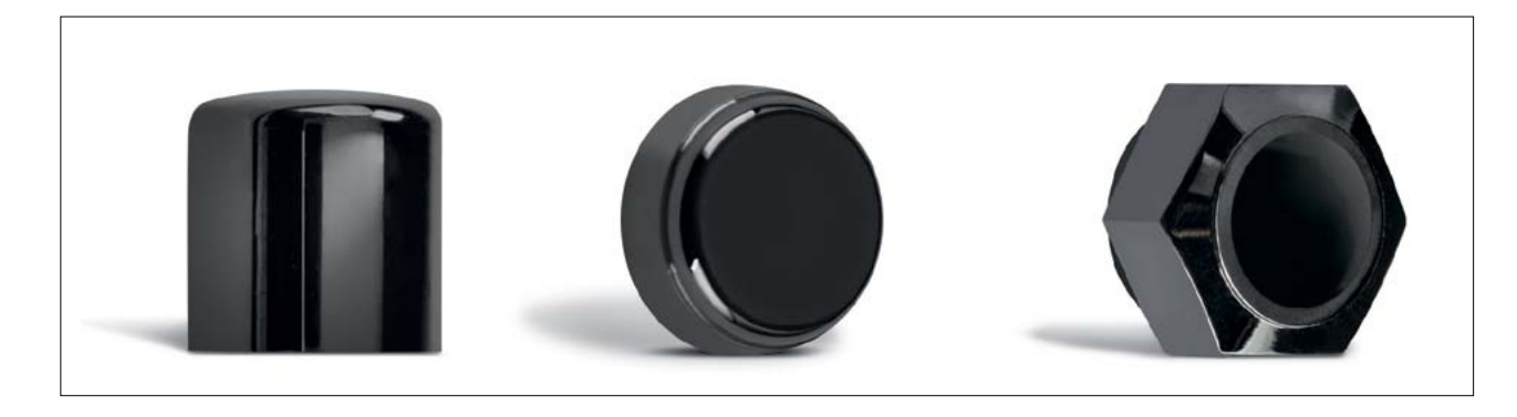
Fig. 2 Precision watch parts with high surface finish and esthetic requirements

shasanovic@ceramaret.ch www.ceramaret.ch