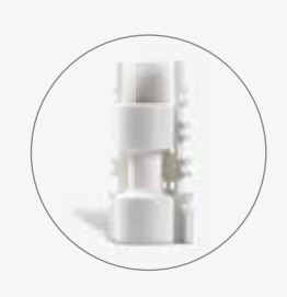
High-precision valve pairing