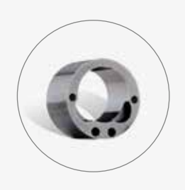
Complex machined parts

Thanks to its technical experience, Ceramaret is able to work with you to design high-precision ceramic parts based on the specific properties of the chosen materials. Our active involvement in the earliest phases of the design and production of your ceramic parts is the guarantee that you'll receive technical solutions at competitive prices. Our in-house capabilities allow us to design unique tools for the different stages in the manufacturing process.