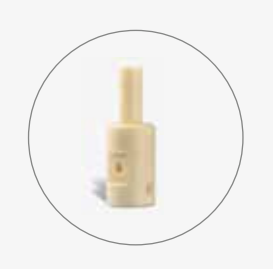
Piston and cylinder units matched for ceramic sealing