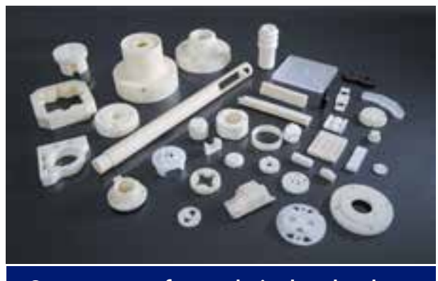
Components for analytical technology

Technical ceramics possess properties that are needed especially for many devices, machines and production plants. They meet specific mechanical, chemical and electrical requirements which make them more appropriate to use than conventional materials.