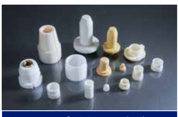
Components for injector technology

Excellent thermal resistance and resistance against aggressive media are the advantageous properties of ceramics.